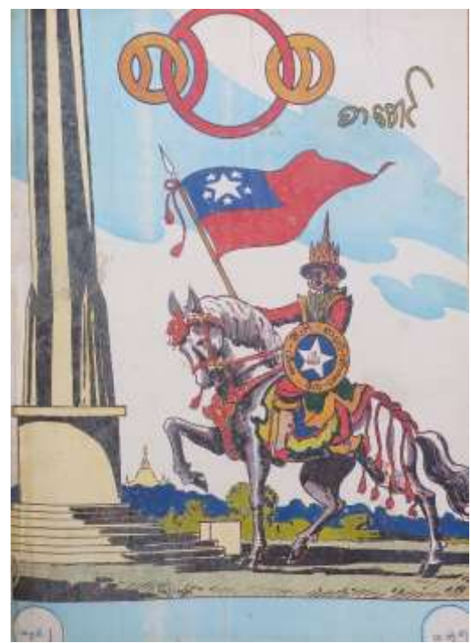
Comparison of Front Covers of the BSI Periodicals Vol. IV, No. 1 and 2 (Front Cover of the rest ten issues are the same with No. 1)